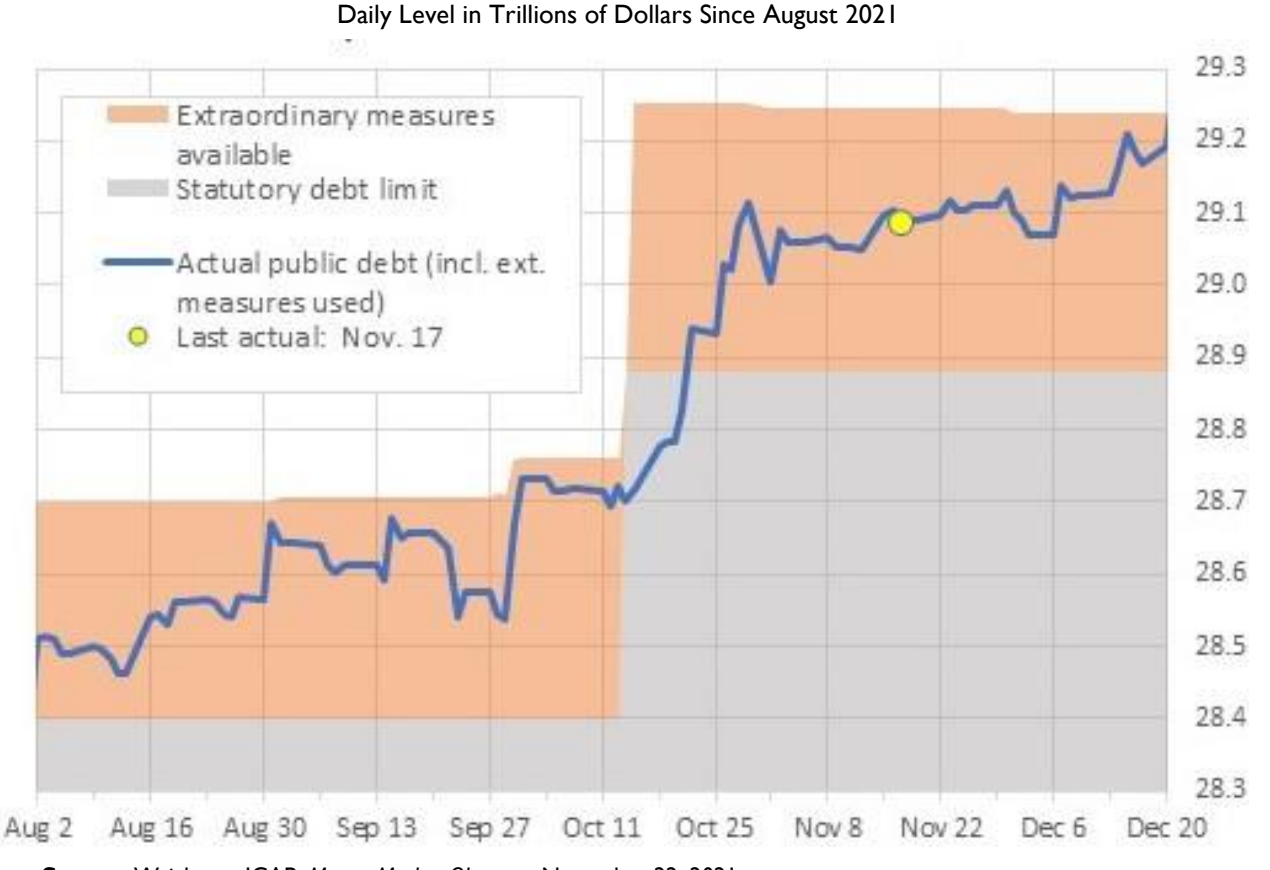
Figure 2. Public Debt and Aggregate Treasury Borrowing Authority